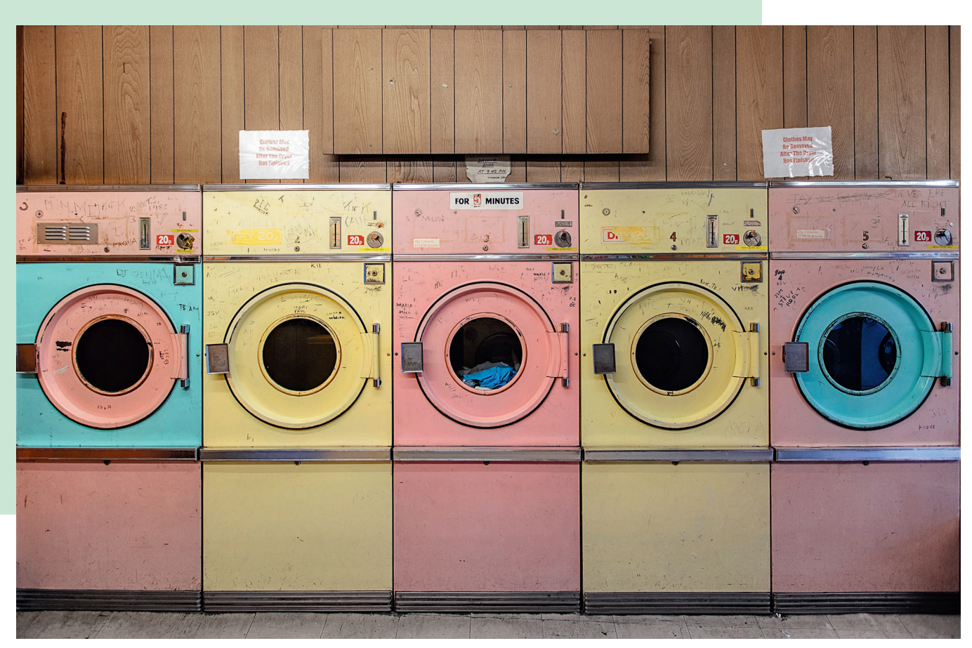
← Maypine Launderette, South Wimbledon